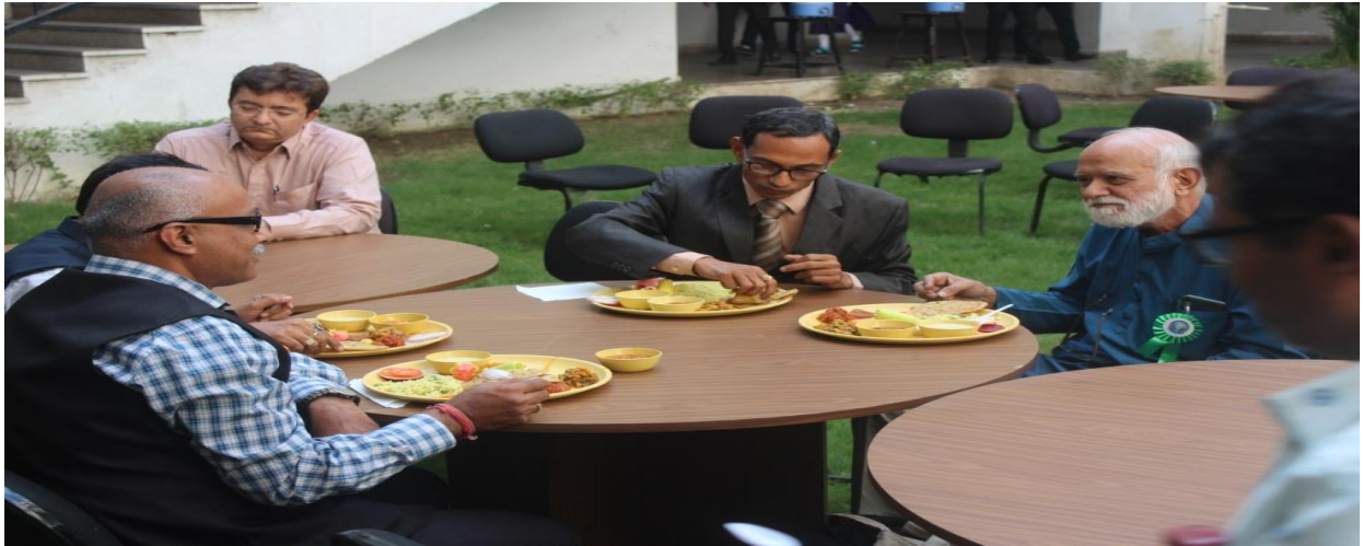
(Session Lunch Break)