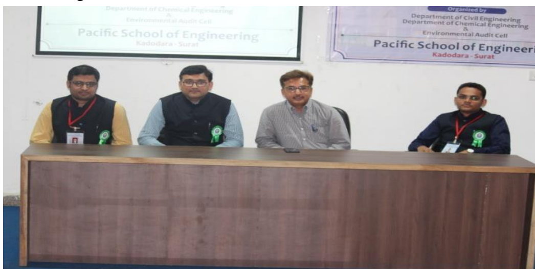
(Coordinators and Co-coordinators of FDP)