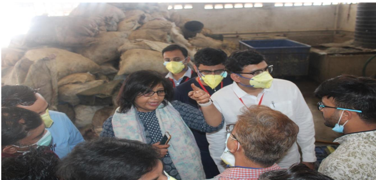
(Industrial visit to Plastic Recycling Waste Unit)