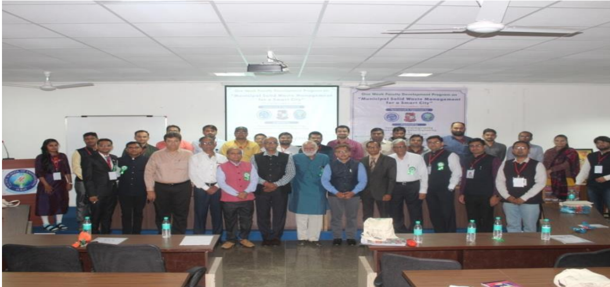
(Participants and Coordinators of FDP)

Total 18 speakers from eminent institutions such as SVNIT, BVM; Government authorities such as municipal corporations, GCPC; professional consultants such as Envision, Pollucon, Enpro were invited to deliver talk on municipal solid waste transport, disposal, segregation and resource recovery from the waste. The major attraction of the experts talks included with biogas and bio compost from MSW, plastics recycling methods and CNG from kitchen waste were specifically appreciated by all participants. Written examination was also conducted for all participants and result was declared same day.