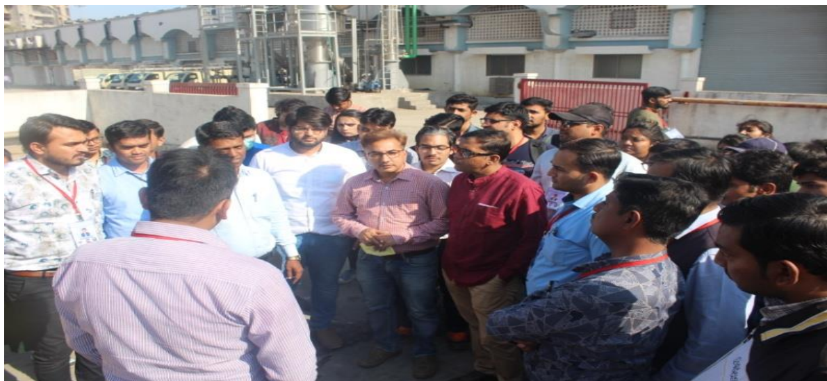
(Industrial visit trip to APMC)