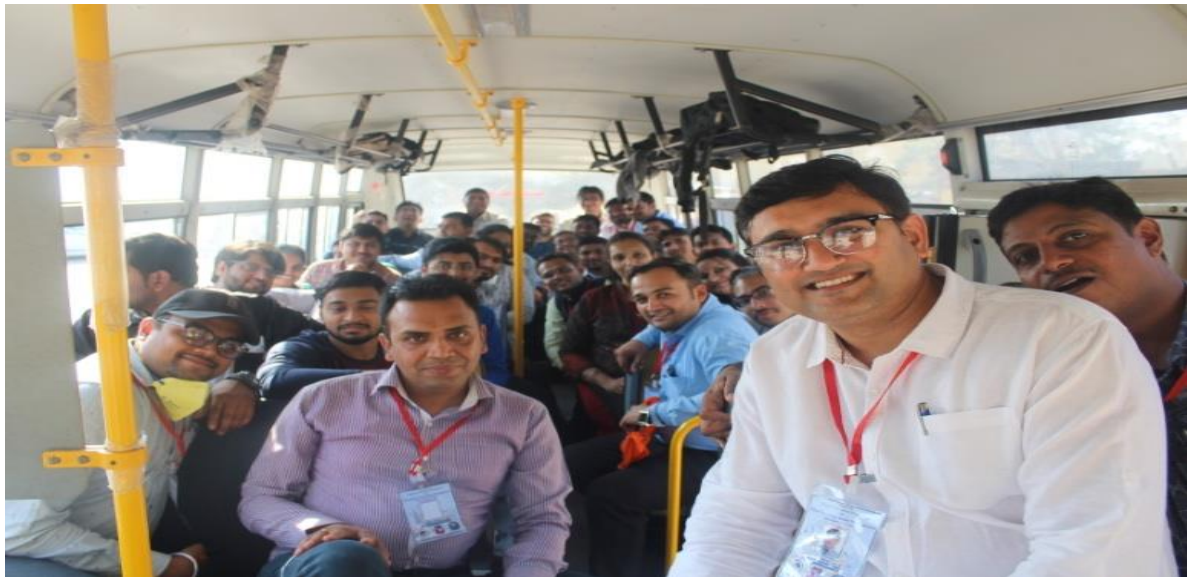
(Faculties in MSW Session)