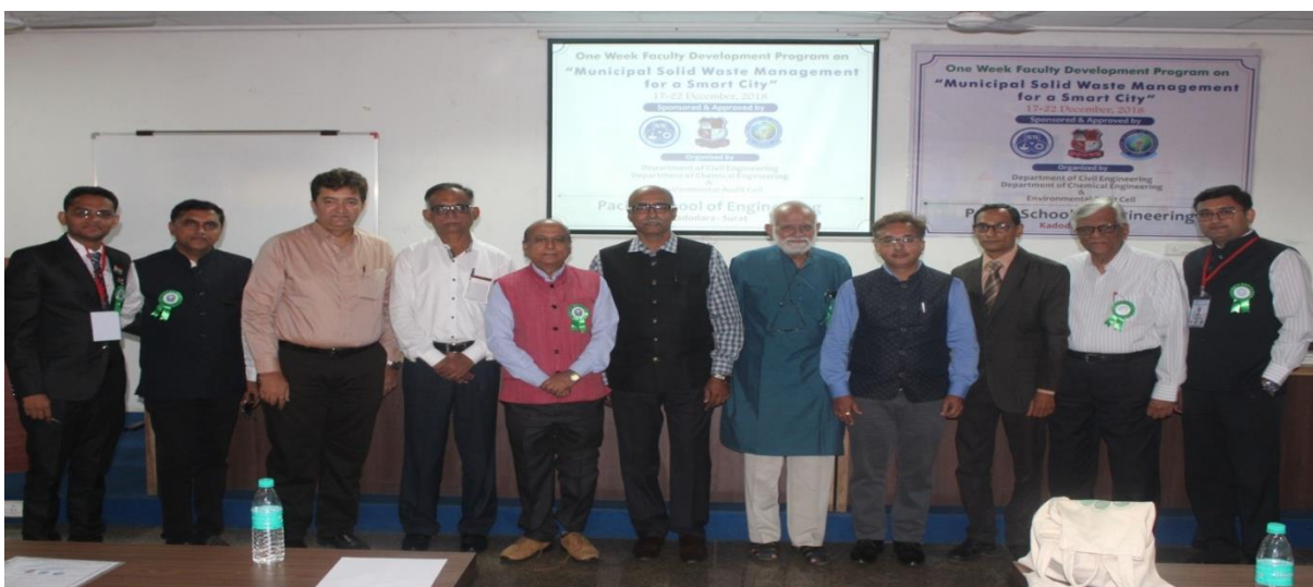
(Dignitaries of FDP)