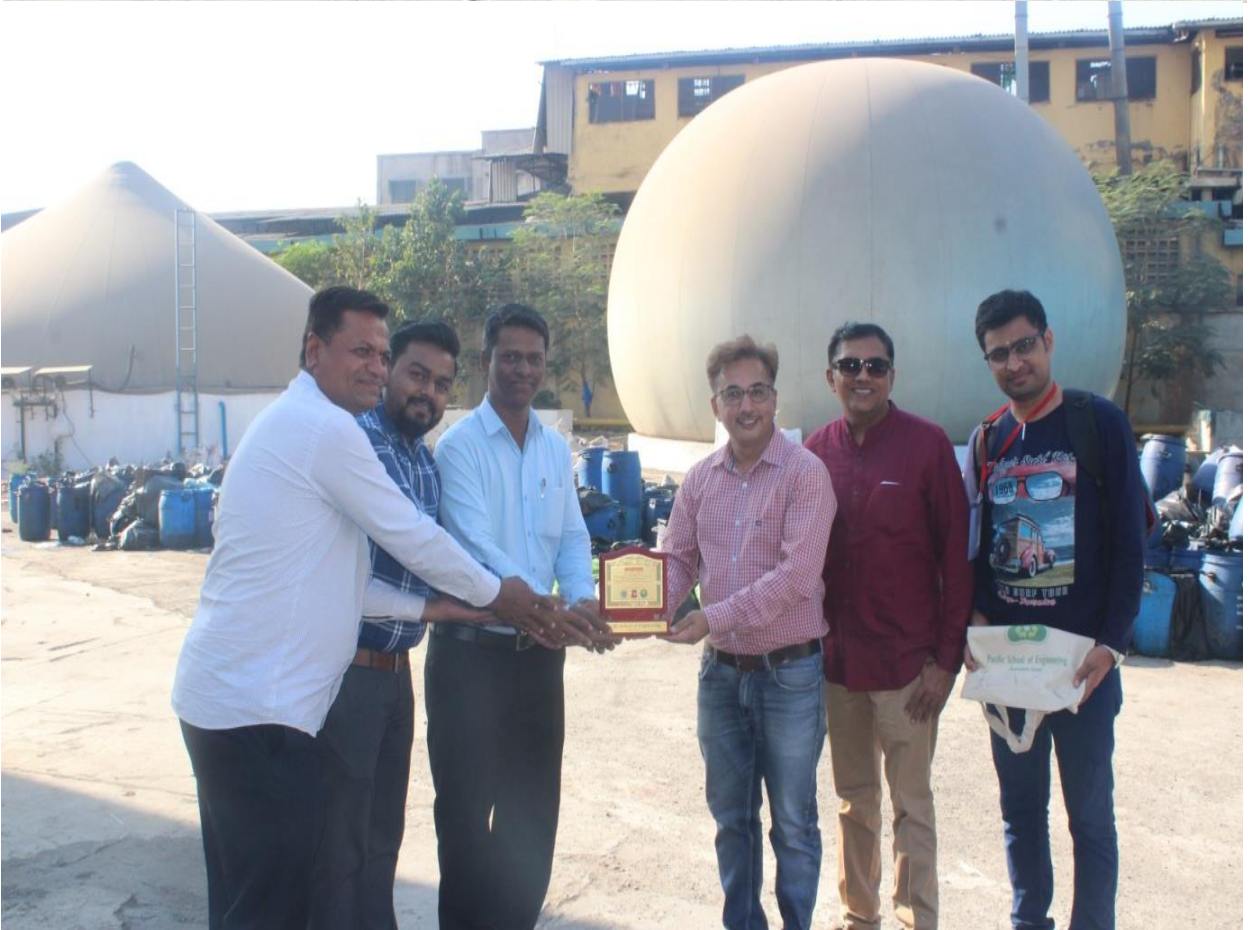
(Memento given by Principal at APMC Biogas plant)