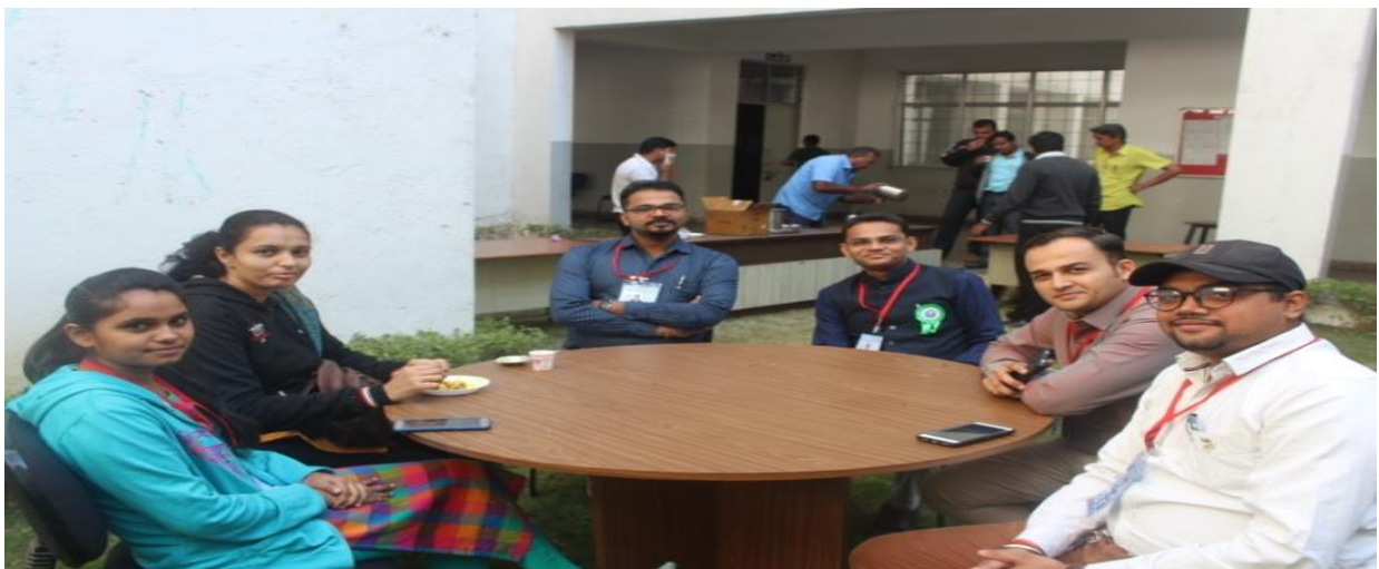
(Session Tea Break)